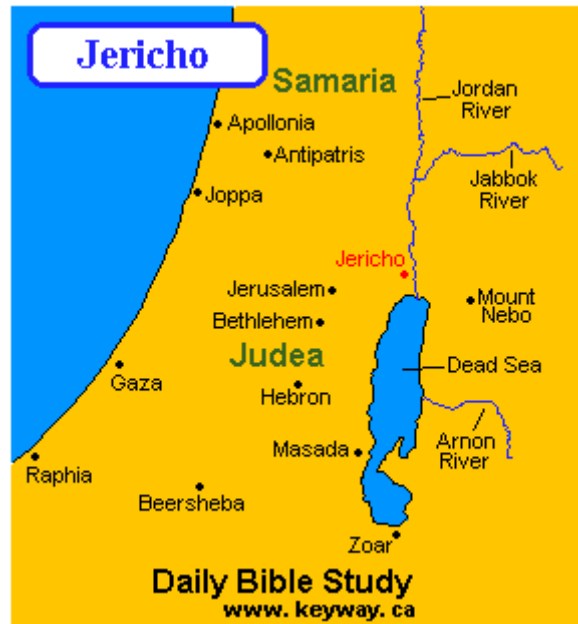
Jericho: Located approximately 6 miles west of the Jordan river